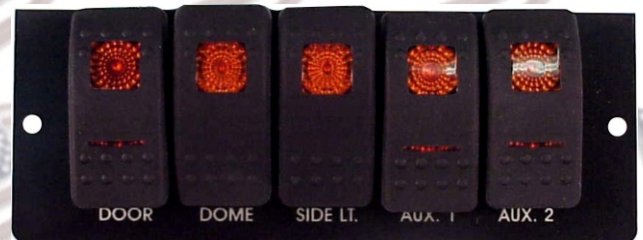
RCT-01026-00900 Black Matte/Reversible Faceplate Shown: Top to Bottom 2 1/2" Left to Right 5 3/4"